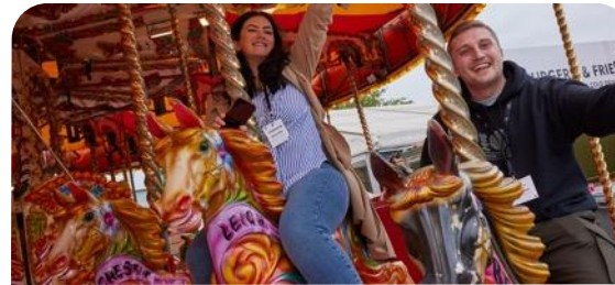
Northampton Saints – WATCH VIDEO