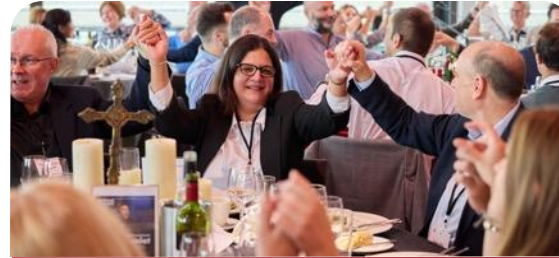
The National Theatre – WATCH VIDEO