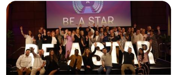
Convention Centre Dublin – WATCH VIDEO