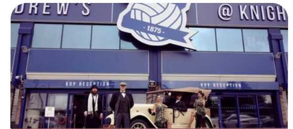
Birmingham City FC – WATCH VIDEO